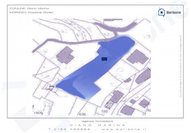
0 1 A N 0 486866 T. 0183